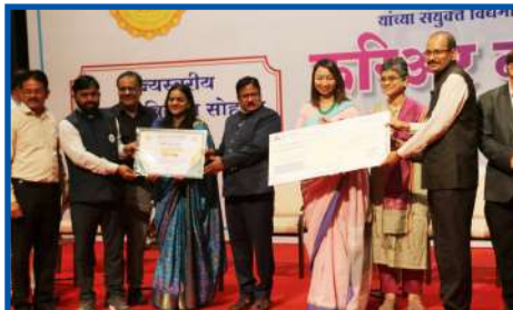
Center of Excellence - A+ Grade Certificate