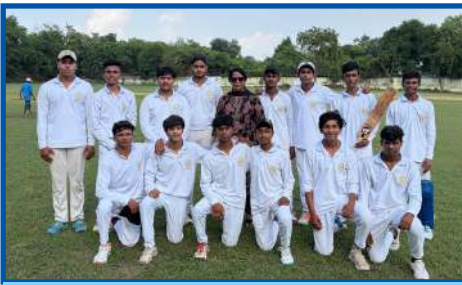
Under 19 Cricket Runner-up Team organized by DSO Tournament (2025-26)