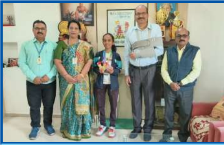
National Level Skating Tournament Gold and Bronze Medal