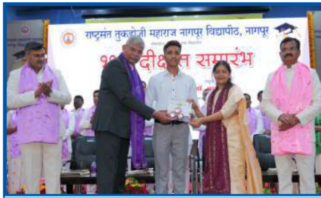
1st Place in the Merit list of M.A. (Political Science)