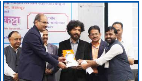
Nagpur District Excellence College Award - 2 nd Prize