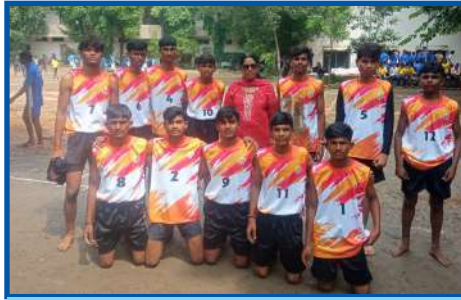
(Under 19) Kho-Kho Team (2025-26)