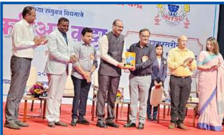
State Level Best Principal Award - 3 rd Prize