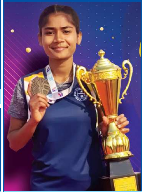
Gold Medal in 6 km Race Under 20 Women's Category at the 60th National Cross Champ.